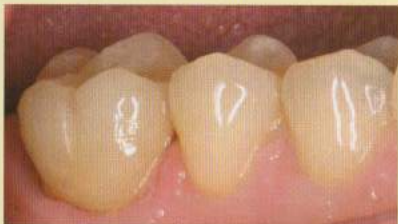
After- Filling replaced by a crown