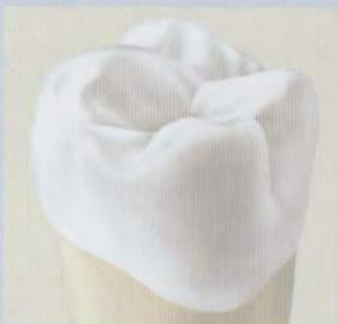
Full ceramic crown