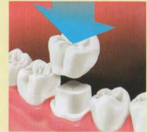
Crown is placed over prepared tooth