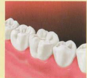
After crown placement