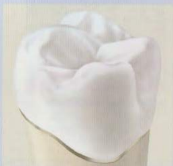
Full porcelain fused to metal crown

Your dentist wants to create a crown that looks natural and fits comfortably in your mouth. To decide on the material for your crown, your dentist will consider the tooth location, the position of the gum tissue, the patient's preference, the amount of tooth that shows when you smile, the color or shade of the tooth, and the function of the tooth.