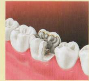
Before crown: Worn filling with decay and broken cusp