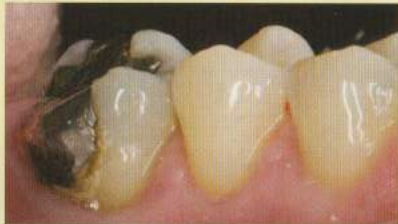
Before- Filling with decay at the edge