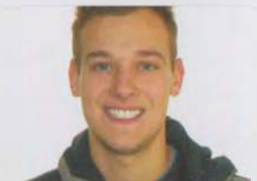
after Six Month Smiles