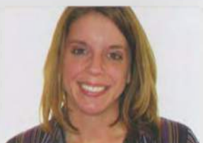
after Six Month Smiles