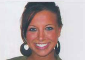
after Six Month Smiles